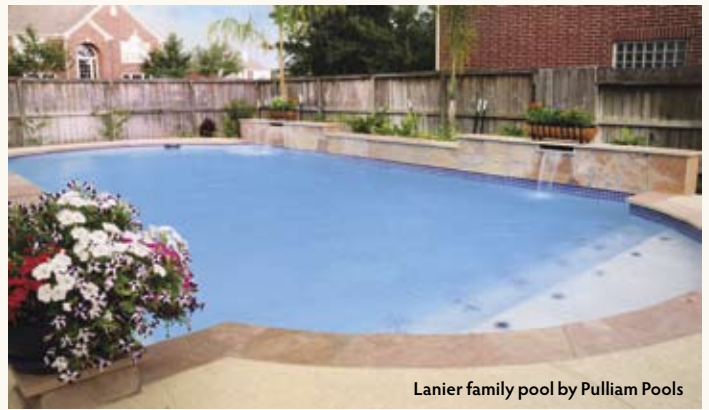
Lanier family pool by Pulliam Pools

Hopkins, of Artisan Pools, suggests including options like rock slides, jump-rocks, waterfalls, and grottos to give the natural rock look for that resort-like effect. A feature that eliminates the need for a diving board is what Hopkins refers to as a deep plunge. Children are finding it just as much fun to jump off a rock or ledge into a seven foot deep end of a pool, and it blends well with the popular trend of freeform pools. Seating within your pool, whether it's a stool, step, or bench, can be a worthwhile investment. The Lanier family opted to put benches inside the pool for the parents who didn't want to swim but still wanted to be close to their children in the water.