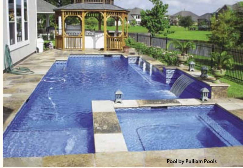
Pool by Pulliam Pools

lounging makes the outdoors feel like an extension of their home.