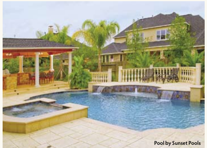
Pool by Sunset Pools

needed shade, and installing fans and lights help create the perfect ambiance for poolside dining or nighttime activities. Poolside fire pits are also a popular addition. Meier says that his company is constructing more fire pits poolside that are gas lit with lava rocks or wood, depending on the buyer's preferences. By using the same materials in the pool's construction, the fire pit enhances the appearance. Outdoor kitchens are also a great option for those who enjoy outdoor entertaining. If this option is out of your price range, consider setting aside a special area for your barbecue. Another refreshing idea to keep the family cool is to invest in a snow cone or a frozen drink machine. The kids can quench their thirst while sticking close to the pool.