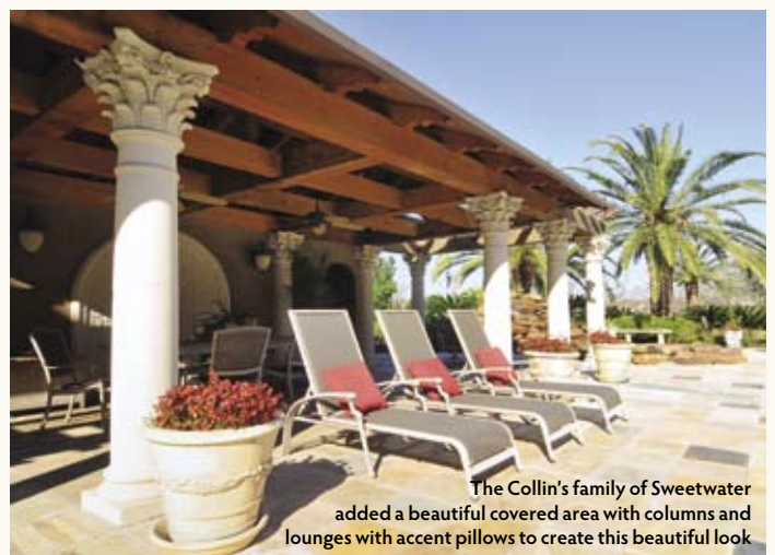
The Collin's family of Sweetwater added a beautiful covered area with columns and lounges with accent pillows to create this beautiful look

There are many ways to boost the appearance of your backyard that don't include a pool builder. The addition of furniture, potted plants, and landscaping can help set the right environment. Many families find creating several different seating areas for dining and