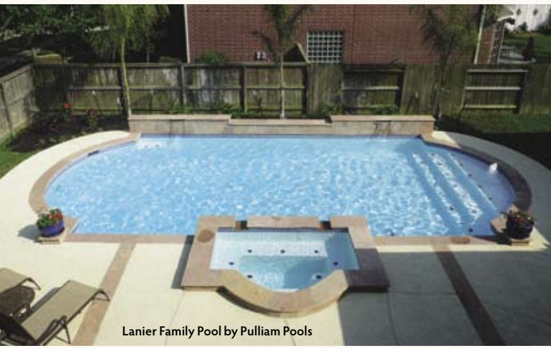
Lanier Family Pool by Pulliam Pools